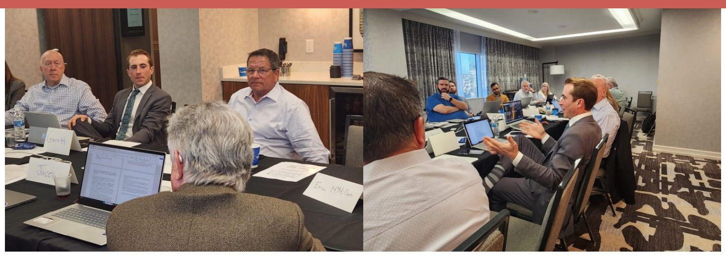
The invitation-only event is being held Feb. 20-22, 2024, at the Hilton Dallas Lincoln Centre.

If you have any questions or need help you can email us