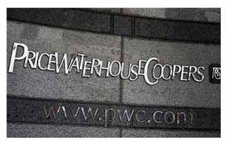
Apr. 24, 2018