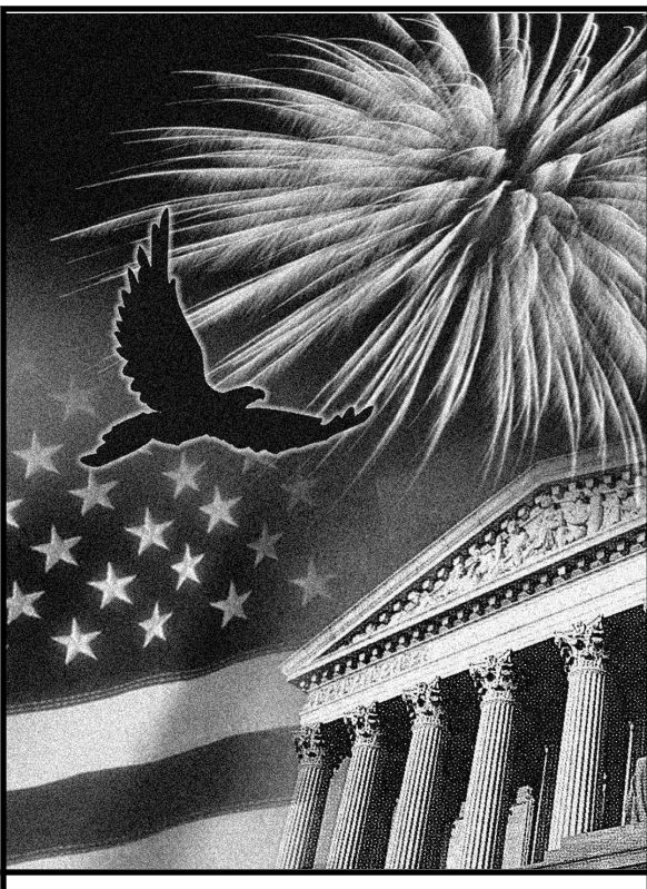
Get forms and other information faster and easier by Internet at IRS.gov