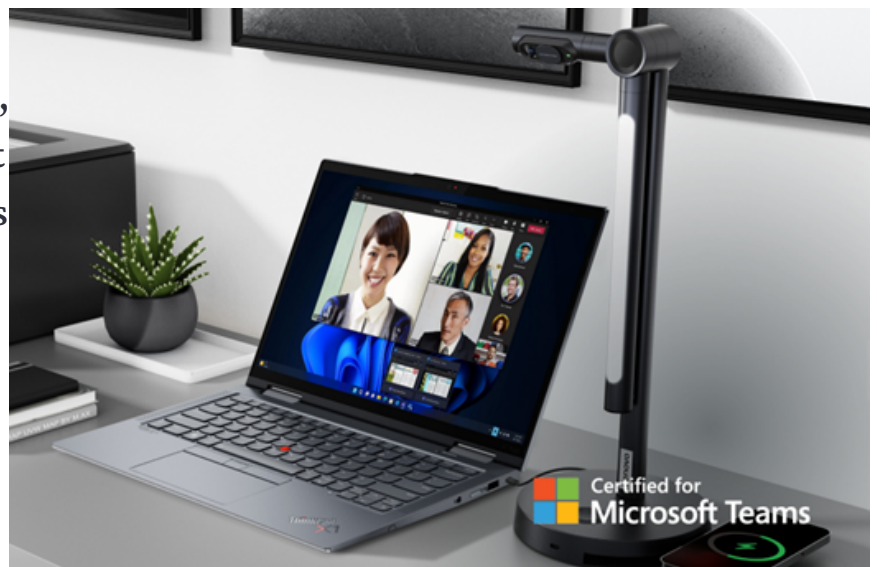
Lenovo Go Desk Station

Since we are talking about Lenovo, we also want to bring up the latest multi-function desk lamp which is ideal for those with very limited "work from home" space. This device combines their Go 4K Pro webcam into an adjustable LED lamp that is optimized to work with Microsoft TEAMS for a professional video calling experience. The hub/dock base