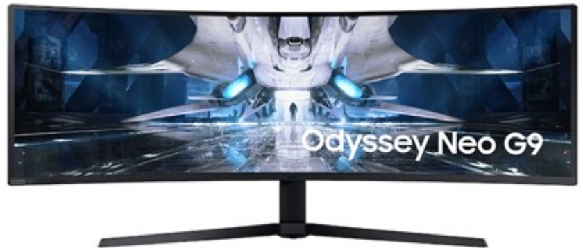
Samsung Neo G9 Display

If time and cost were no object, one monitor I would consider augmenting my workstation with would be Samsung's Odyssey G9, which sports a 57" curved mini-LED display with a 7680×2160 resolution in a 32:9 aspect ratio.