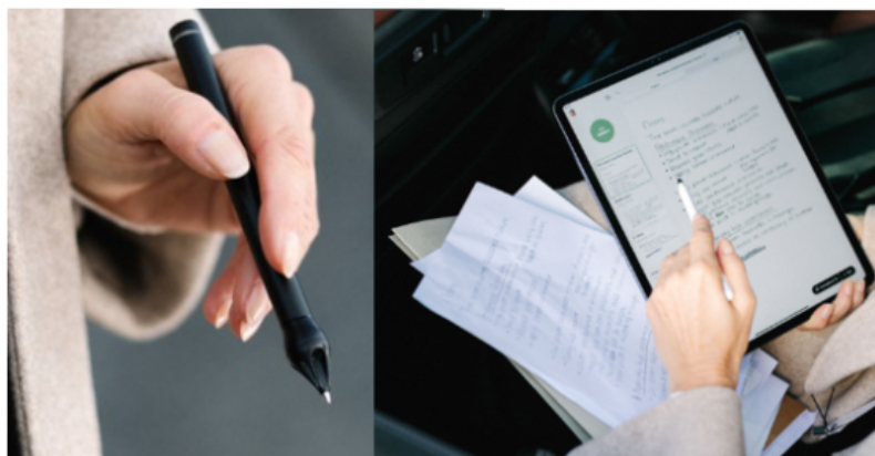
Nuwa Digital Pen

BONUS: OK, I said five amazing products, but an additional product that popped up and that I found interesting from a design perspective (but have some skepticism about) was the Nuwa Pen. This device records your handwriting on any type of surface via built-in cameras and infrared technology (for recording in